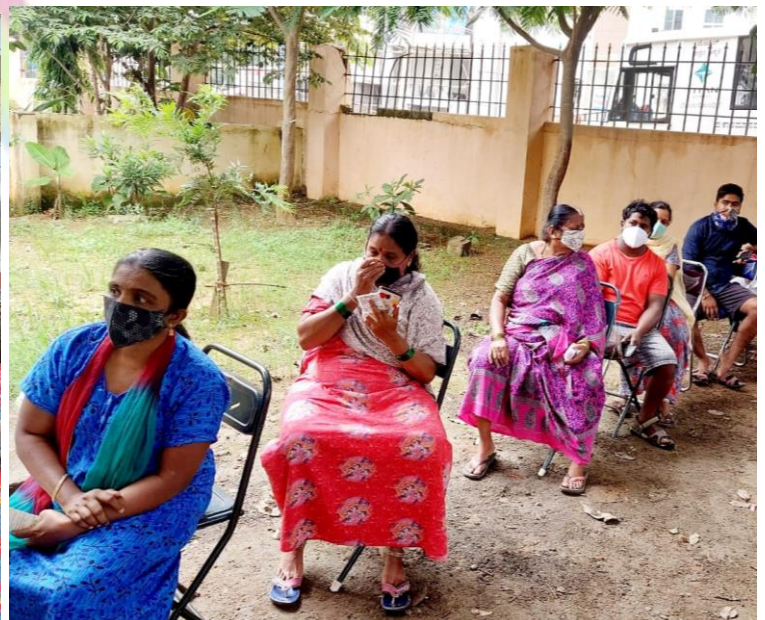
Participants queuing up outside the mobile unit