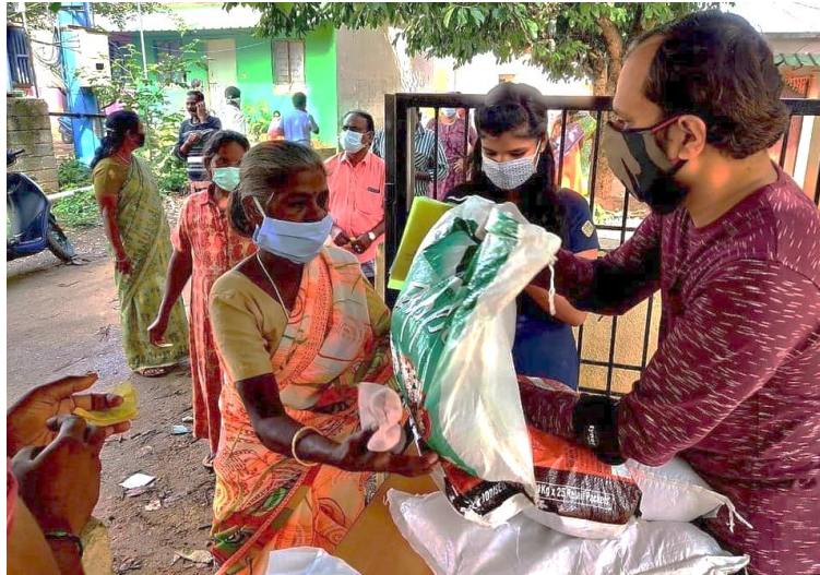
A still from a video of the drive posted on the Facebook handle of Urjavya Foundation

Urjavya shall continue to extend support in Bangalore, Pune, Delhi and Jharkhand in the coming days.