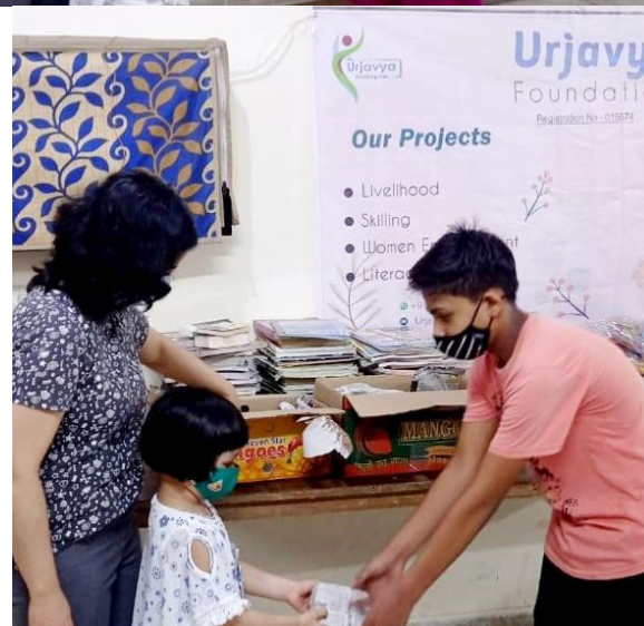
Children receiving books at the drive