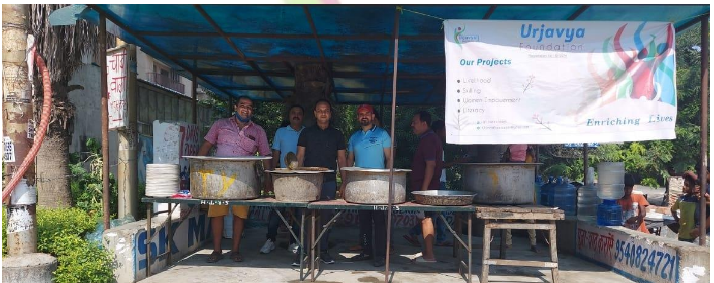
Urjavya Foundation Volunteers pictured behind the food containers