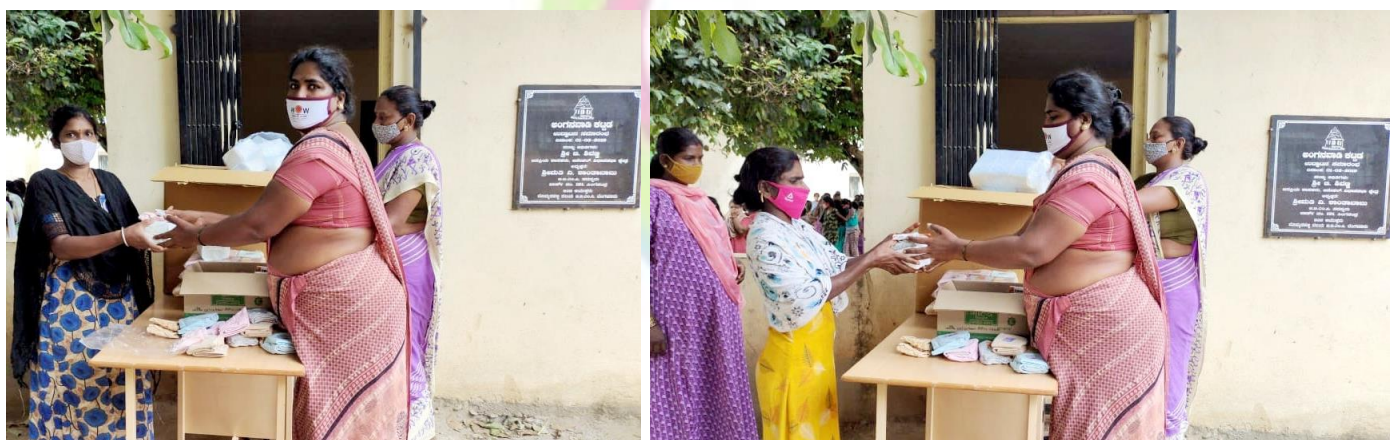
Donation of sanitary napkins in process in Kudlu

In the next few days, we intend to reach an increasing number of needy women in urban slums and rural areas. Urjavya thanks volunteers and well-wishers who provided their help in the distribution efforts.