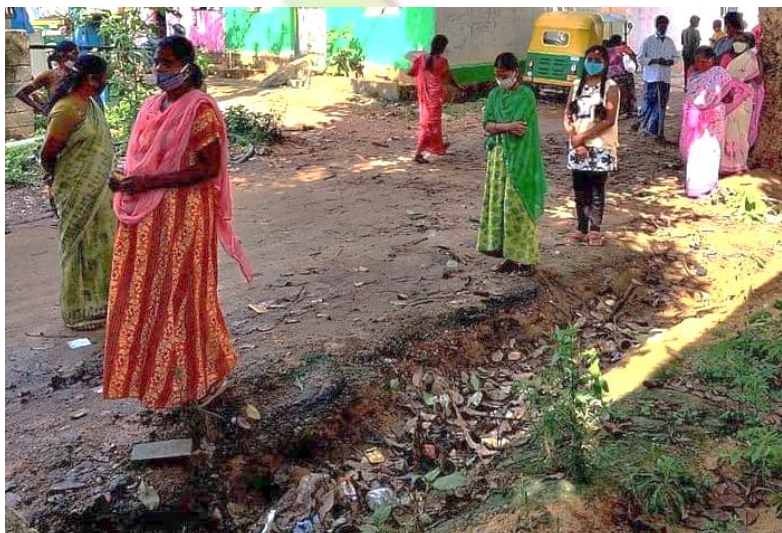
Beneficiaries queuing up to receive kits