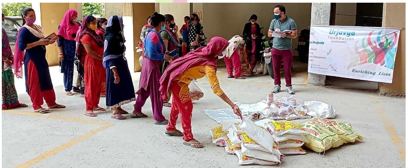
Images from the grocery kit distribution drive in New Delhi