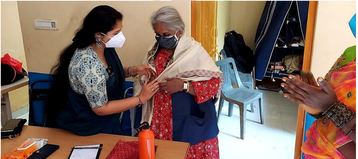
Speaker at the session being felicitated