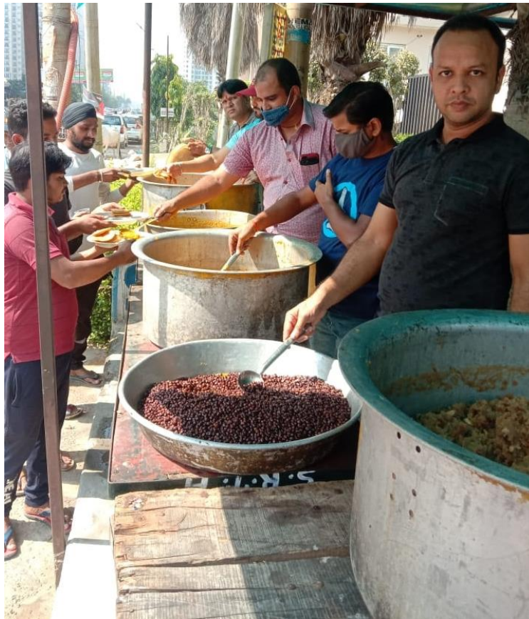
Food items being served during the distribution drive in New Delhi