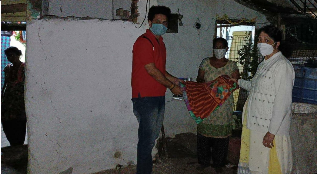
Beneficiaries receiving blankets from Urjavya Foundation volunteers