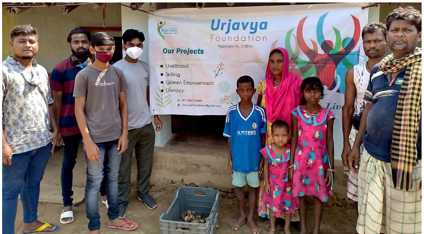
Participants with the ducklings and Urjavya Foundation volunteers

Urjavya Foundation successfully conducted a second duckling distribution drive in the tribal block of Potka in Jharkhand. Our volunteers distributed 10 Indian Runner ducklings each and feed to 25 marginalised families. Duck Farming can be a lucrative income generation occupation for small and marginal farmers including landless classes and tribal women due to the ducks requiring minimal maintenance, having high disease resistance, longer and economic egg production life. Urjavya Foundation thanks veterinarian Dr. Payes Marshal for ensuring their presence and providing basic training to the people on best practices to be followed in duck farming. Urjavya also thanks volunteer Mr. Abhik for coordinating the entire event. We are thankful to our continued project partner - The Sidhwa Trust.