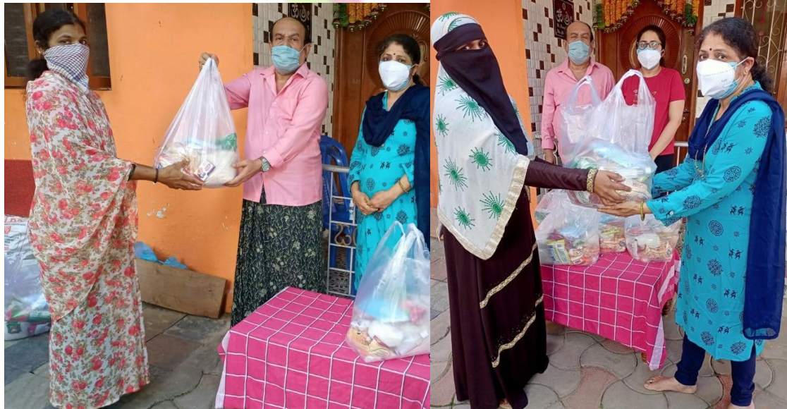
Urjavya Foundation volunteers donating kits among families in Shivamogga, Karnataka