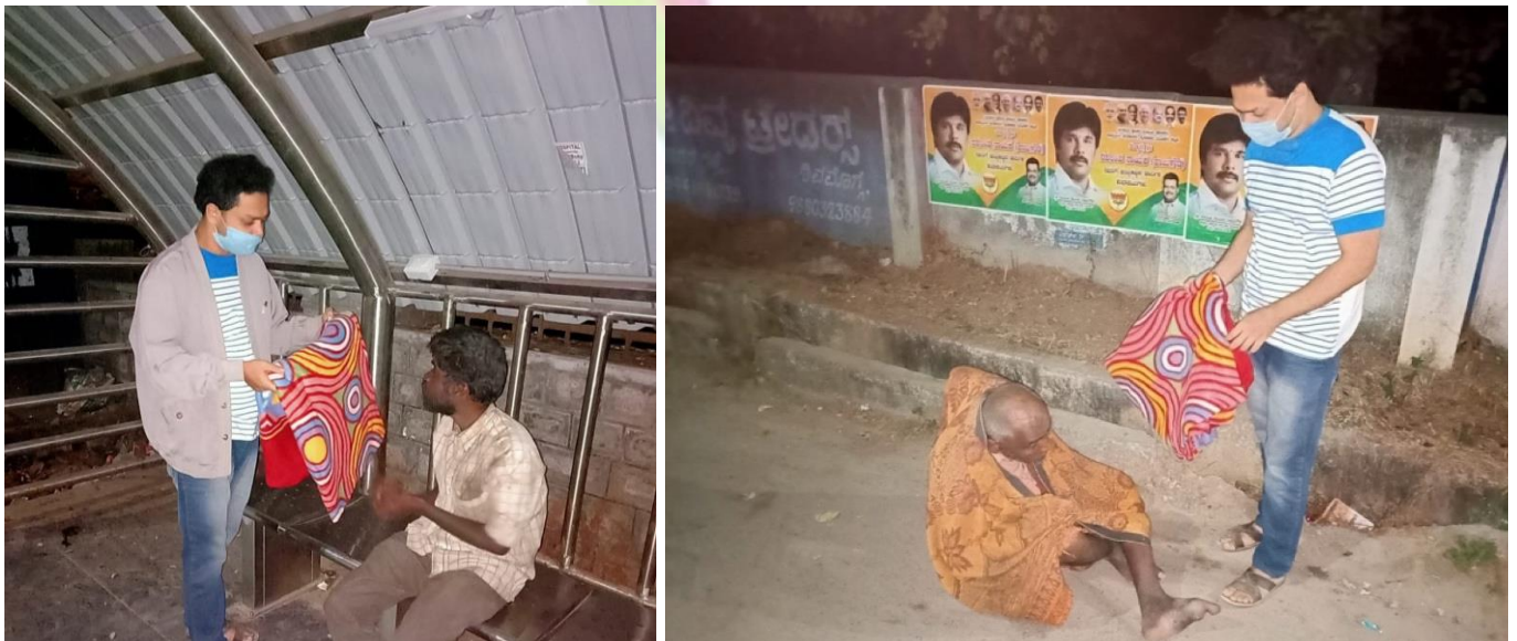
Beneficiaries receiving a blanket from an Urjavya Foundation volunteer

Without proper insulation, sleeping or working outside in chilly weathers can cause issues like bone and joint pain, low blood pressure and fatigue. It can even be fatal if not addressed adequately. Many poor people often face hypothermia in the colder months of the year.