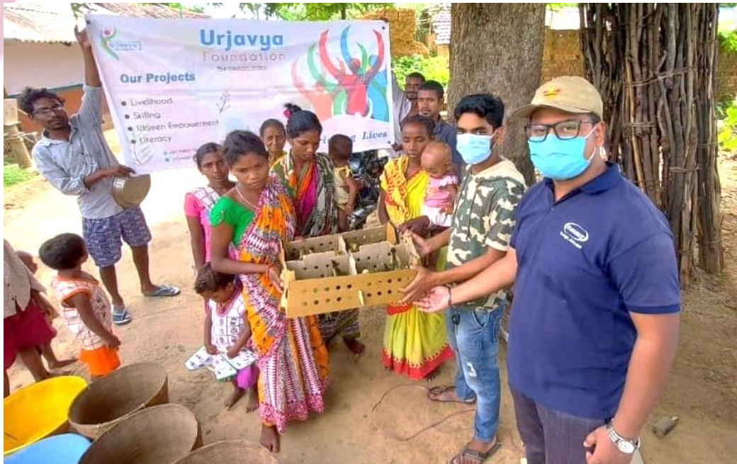
Participants receiving supplies for duck farming