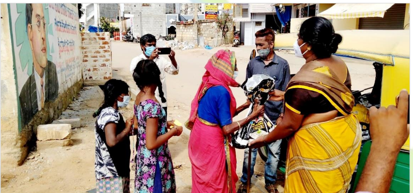
Distribution area of the drive