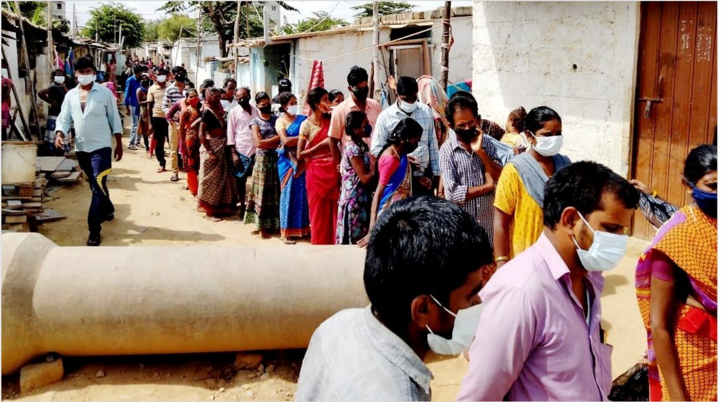
Beneficiaries queuing up outside the distribution area

In continued partnership with UST Global and SD Foundation, 100 more grocery kits were recently distributed in Bengaluru. Urjavya Foundation heartily thanks UST Global and Sarojini Damodaran Foundation for their contributions.