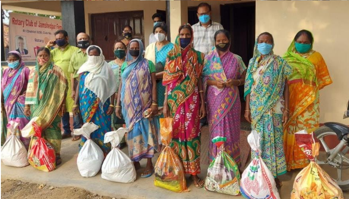
Jamshedpur Rotary Club members (top) and beneficiaries (bottom) pictured at the drive