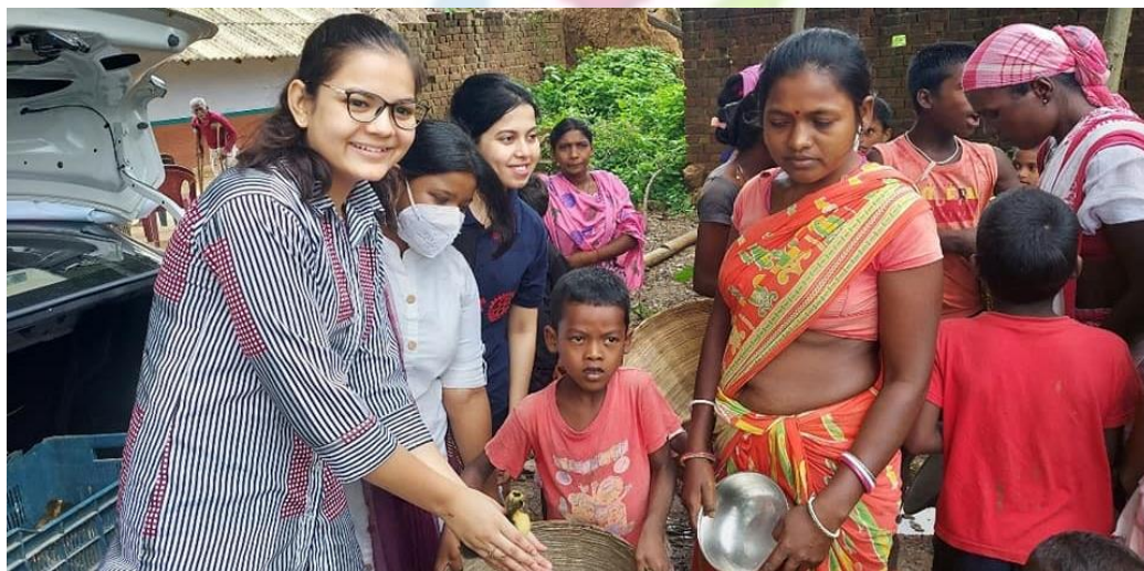
Birsa Agricultural University students distributing duckling feed to the families