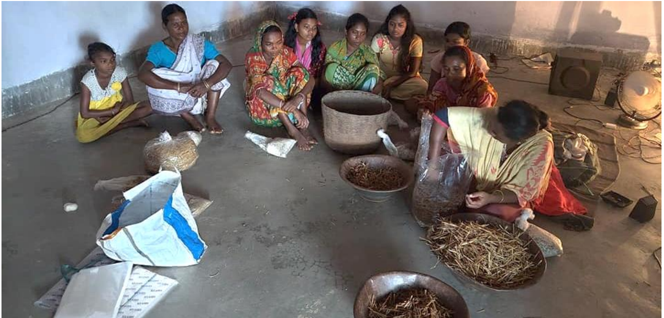
Ongoing training in Bootgoda

Urjavya Foundation held another mushroom farming session in Bootgoda village of Jharkhand, discussing its potential for income generation and nutrition. Each participant received 1 kg high-quality oyster spawn and other components of mushroom production. Our team will mentor the beneficiaries on a regular schedule. We thank The Sidhwa Trust, our project partner in this initiative.