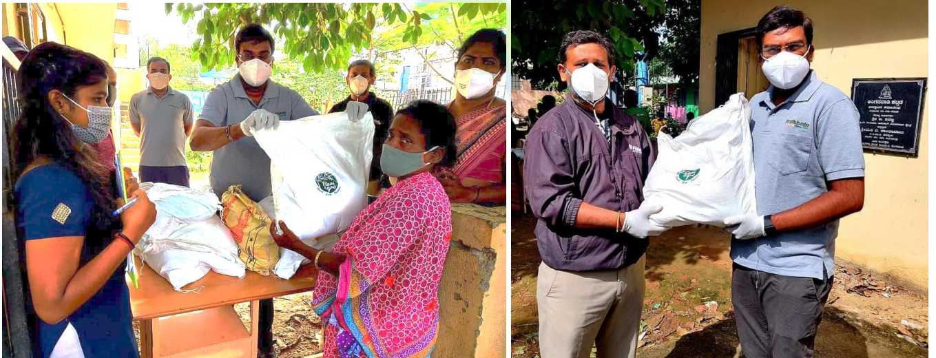
Beneficiaries receiving grocery kits from a Prathibimba Trust member