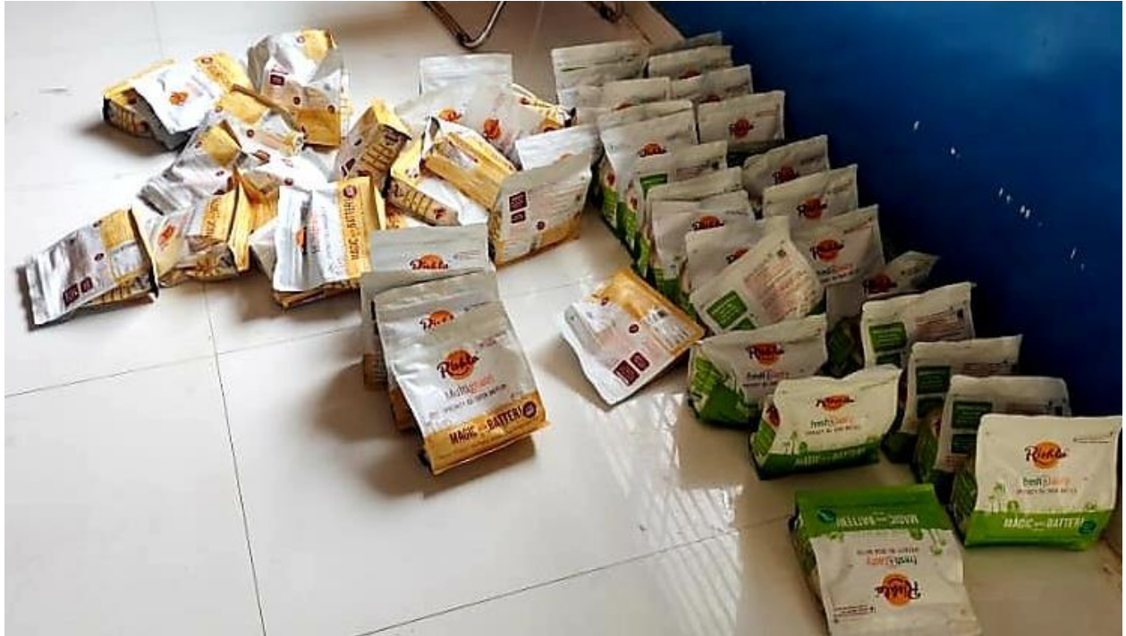
Rishta premium dosa batter packets arranged for donation

In association with another organized named Swabhimaan, which is an NGO focusing on upliftment of underprivileged people and ensuring a better life for them, Urjavya Foundation donated 1 kilogram premium quality Rishta dosa batter packets in Kudlu and its surrounding areas of urban slums.