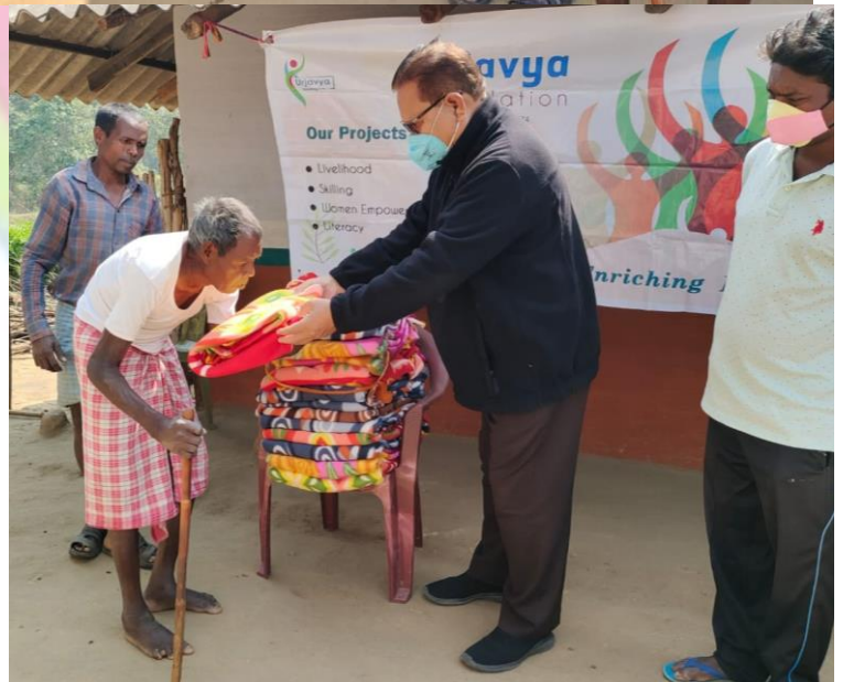
Baaliposh beneficiaries receiving blankets from Urjavya Foundation team