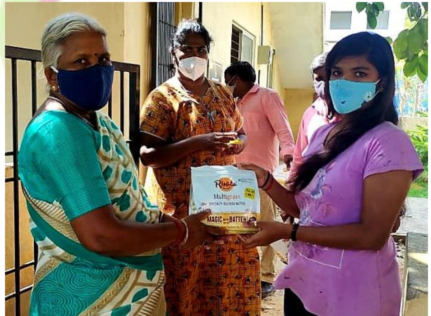
A beneficiary receiving the kit from a volunteer