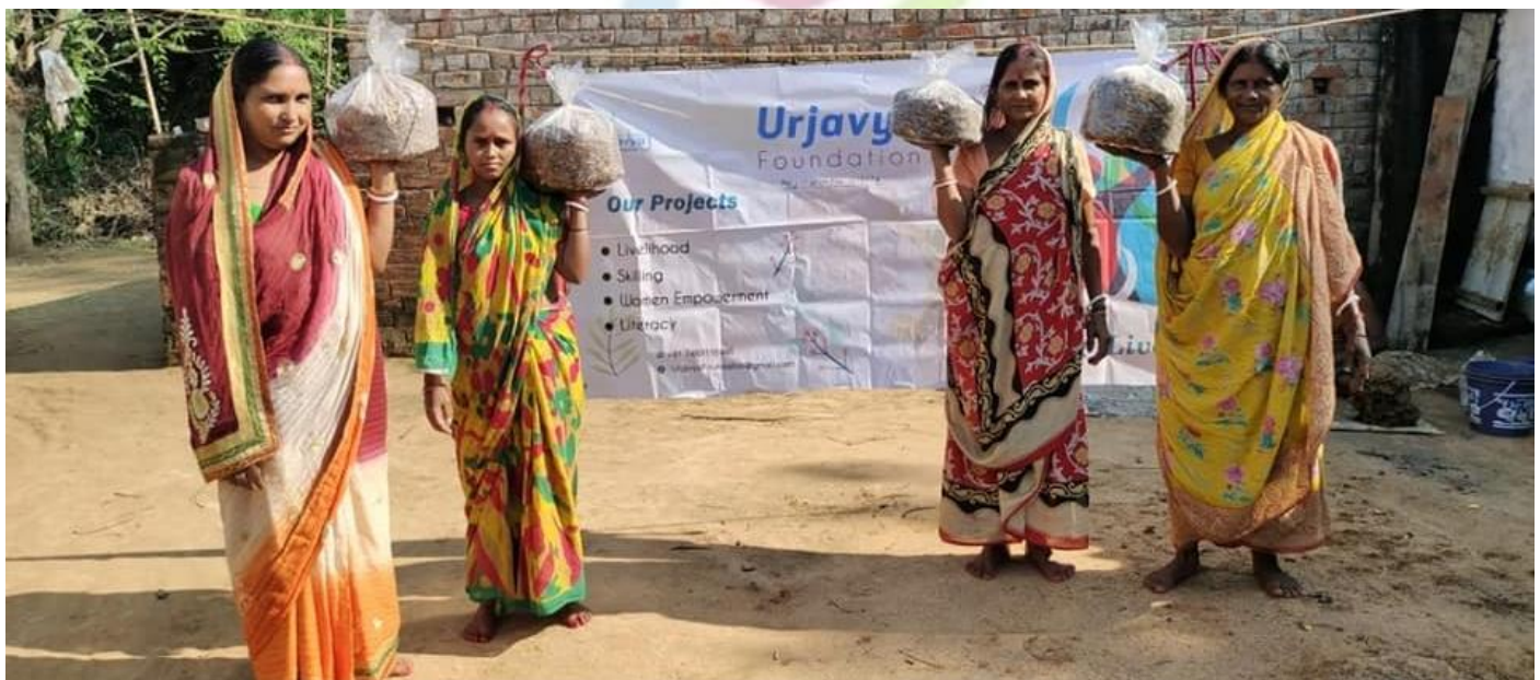
Beneficiaries with their prepared mushroom kits