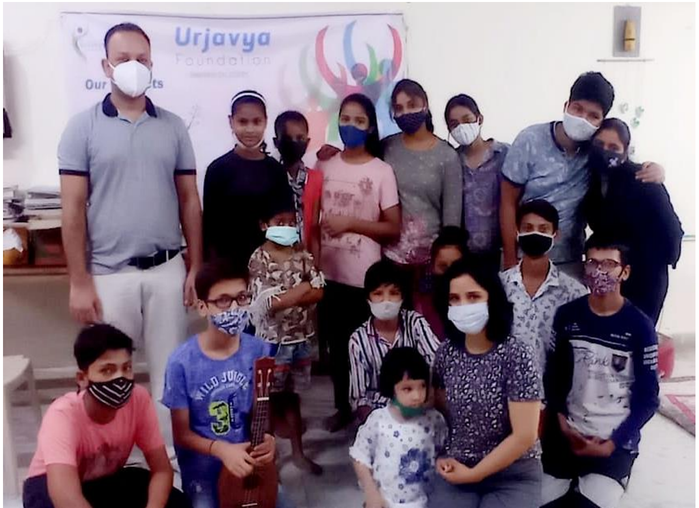
Participants of the drive