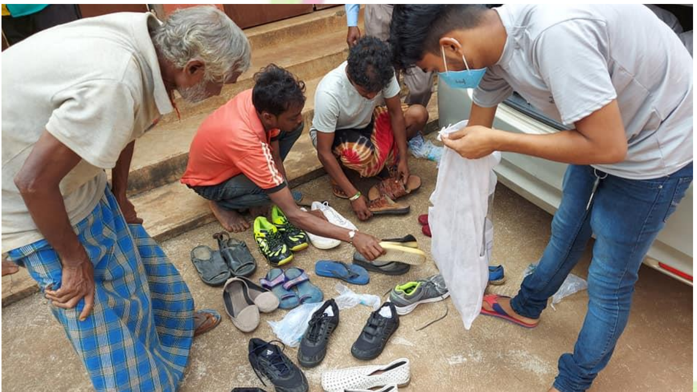
Arrangement of footwear before distribution to the beneficiaries

Urjavya Team has distributed the footwears in a tribal village of Jharkhand. We thank Ms. Sia and the Sole Warriors Community for arranging the footwears for the distribution. Since the village is located near a forest area, having a pair of shoes ensures safety and prevents diseases and injuries that people might face.