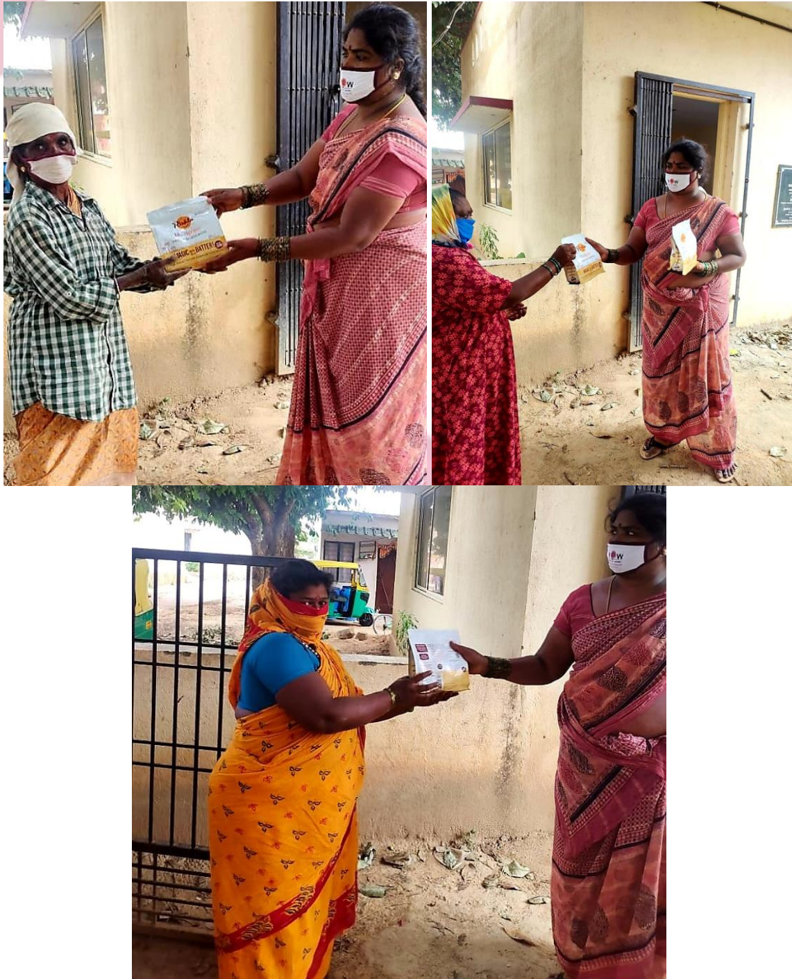
Participants of the drive receiving kits from an Urjavya volunteer

Urjavya Foundation thanks Swabhimaan Trust for their partnership in making this leg of the overall donation drive fruitful.