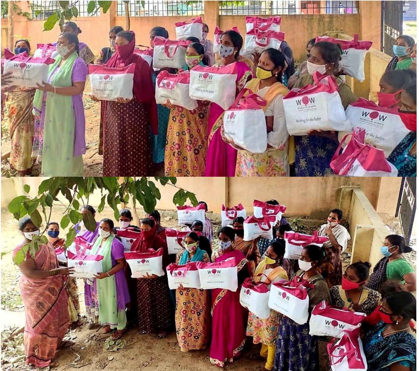
Beneficiaries pictured with the World of Women sanitary napkin sets

Continuing the long-standing partnership with World of Women (WOW) for Urjavya Foundation's women empowerment umbrella initiative, another drive of sanitary napkin distribution was organised in Kudlu. Each participant was given sets of sanitary napkins that would last them for 6 menstrual cycles.