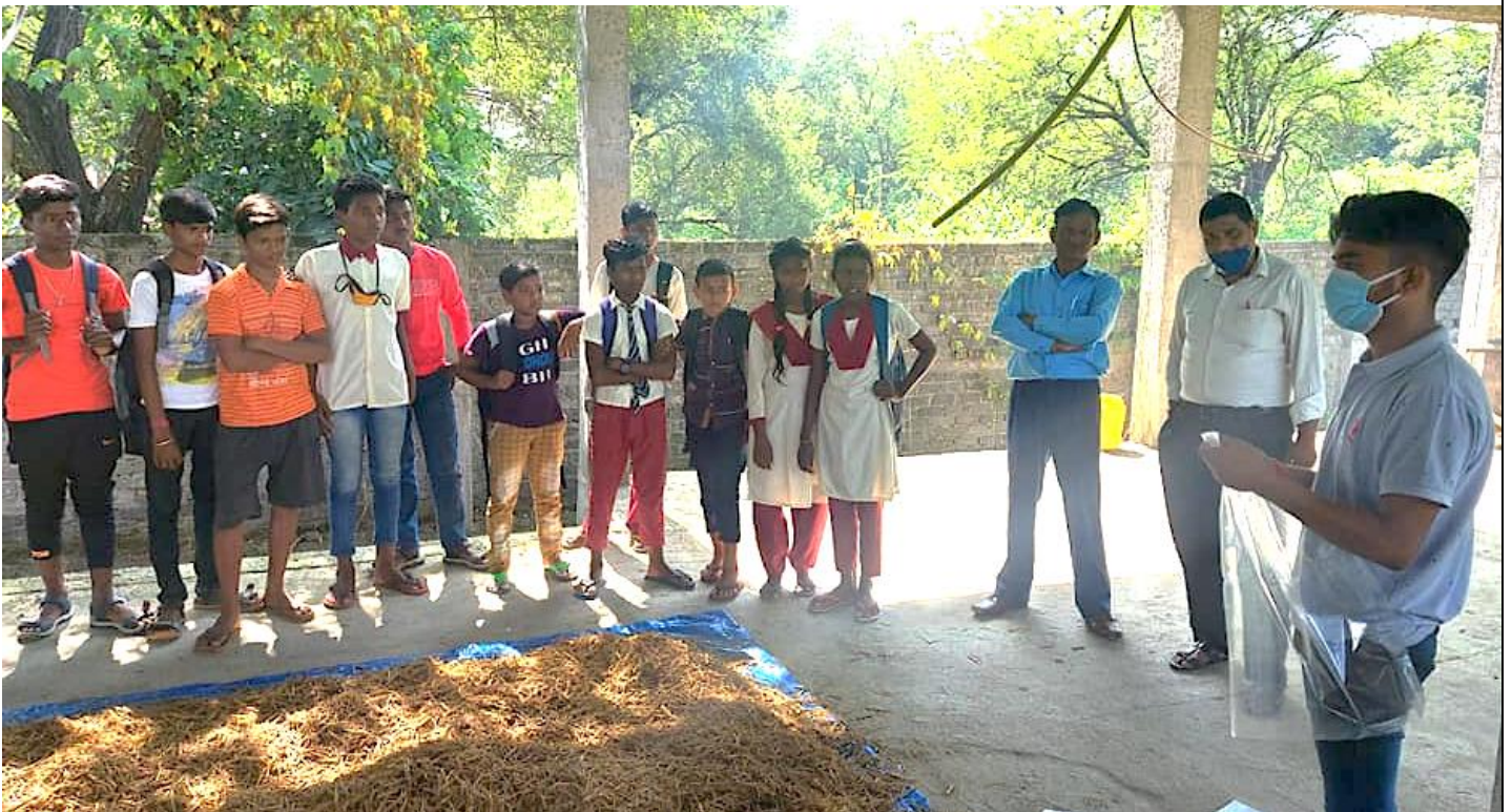
Urjavya Foundation team giving a demonstration and training to school students

Urjavya Foundation team has extended its mushroom training awareness to children as well, as our volunteers gave Jharkhand school students a training overview. Our team covered the nutritional benefits of mushrooms, the 3-day lifespan of oyster mushrooms as opposed to the few hours' of paddy straw mushrooms, and using of extra substrate in vermicompost. Our team is dedicated to reaching out to the most remote regions to raise awareness about organic, chemical-free and environment-friendly methods of mushroom farming.