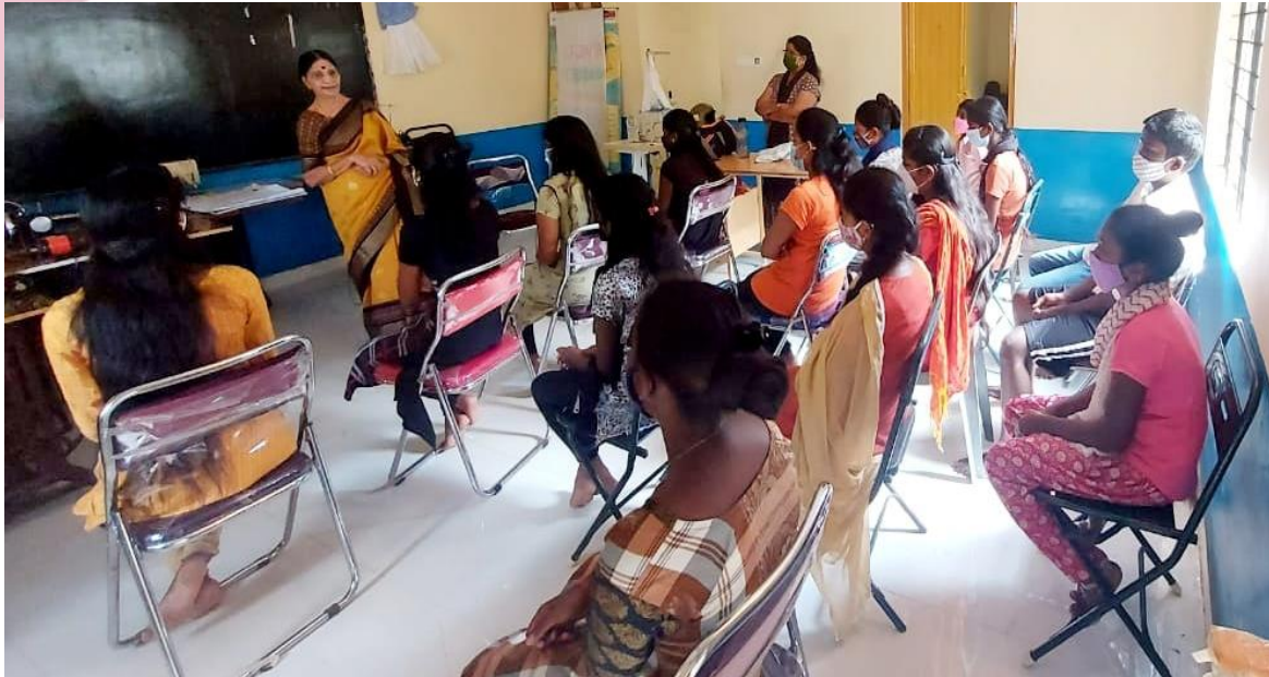
Session being conducted at the Urjavya Foundation centre in Kudlu