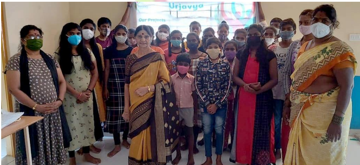
In-person participants of the session