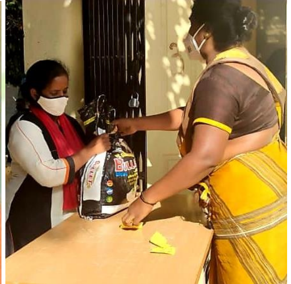
Donation drive being conducted outside the tailoring centre established by Urjavya Foundation in 2020