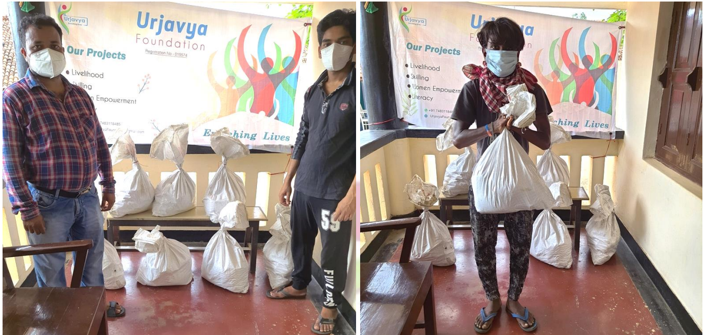
Images from the drive in Jharkhand