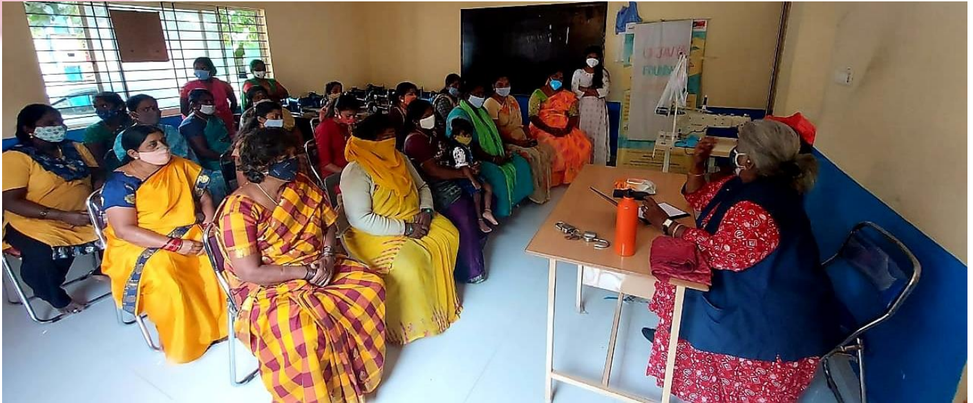
The session in progress