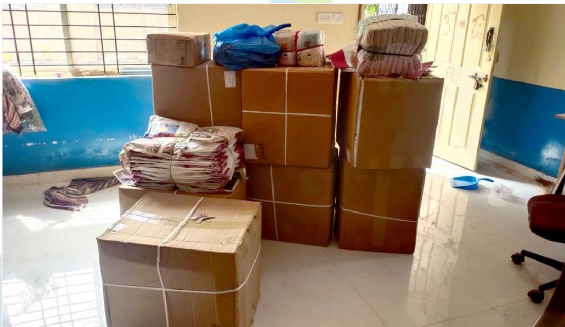
Sanitary napkins stored before distribution in the Urjavya Foundation-established centre in Kudlu

With COVID-19 and its ongoing implications, most underprivileged women have had limited access to sanitary pads. Basic necessities and survival of families have become important, causing menstrual health to become side-lined in these communities. Poor menstrual hygiene can lead to a variety of fungal and bacterial infections, and chronic or fatal diseases. In collaboration with World of Women (WOW) Foundation, Urjavya Foundation delivered sanitary pads to underprivileged women in Kudlu.