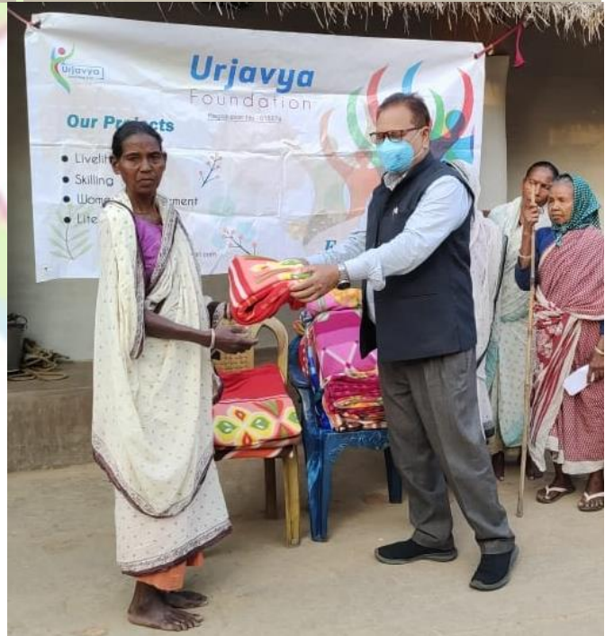
Pandudih beneficiaries with their blankets