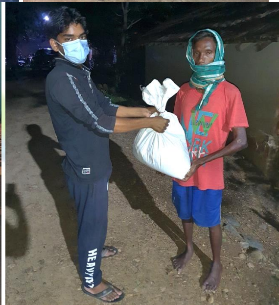
Beneficiaries in Jharkhand receiving kits from an Urjavya volunteer