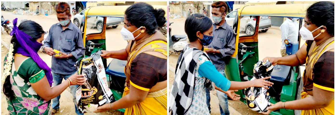
Beneficiaries receiving the grocery kits from an Urjavya Foundation volunteer

Urjavya Foundation team hopes to continue our joint efforts and collaborations with more organizations in making successful endeavours for the betterment of the underprivileged people in society.