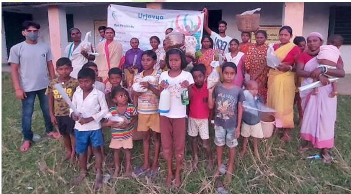
Beneficiaries during the session, and afterwards with their oyster spawn kits