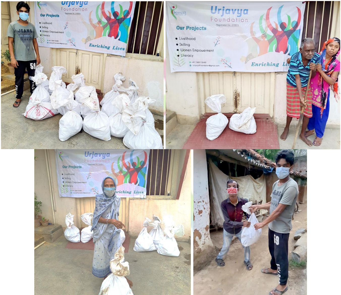
Differently-abled and widow beneficiaries receiving grocery kits