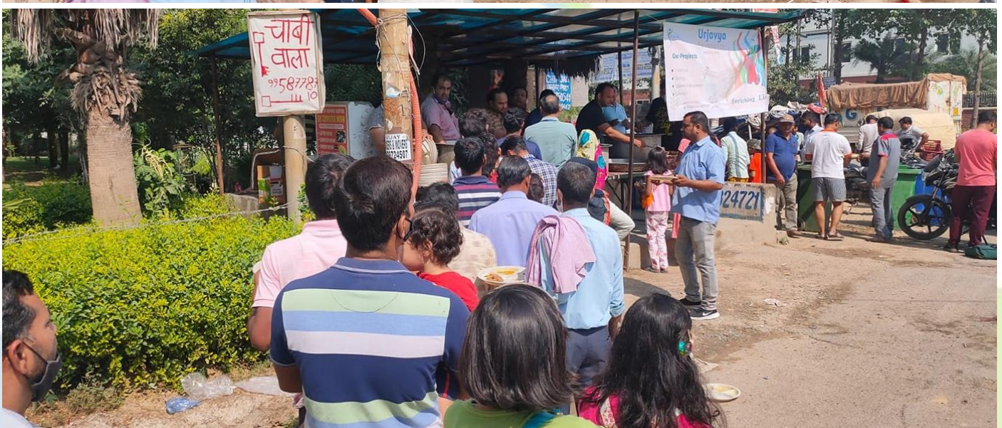
Beneficiaries queued up near the stall