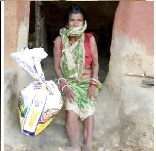
Continued kit distribution in remote areas of Jharkhand