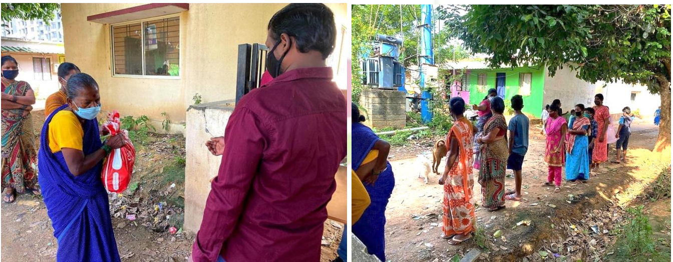
Beneficiaries from Kudlu receiving the kits