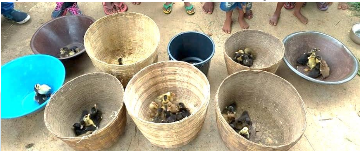
Ducklings distributed among families

There have been instances where a large number of villagers from Jharkhand's remote areas have moved from cities to villages in search of alternative sources of income. To foster local development and to promote individuals to work on promising ventures in their villages, Urjavya Foundation collaborated with veterinary students from Birsa Agriculture University in Ranchi, to learn the most effective methods for raising ducks. As a pilot initiative, 20 tribal families were given ducklings, feed and were trained on the specifics of raising them.