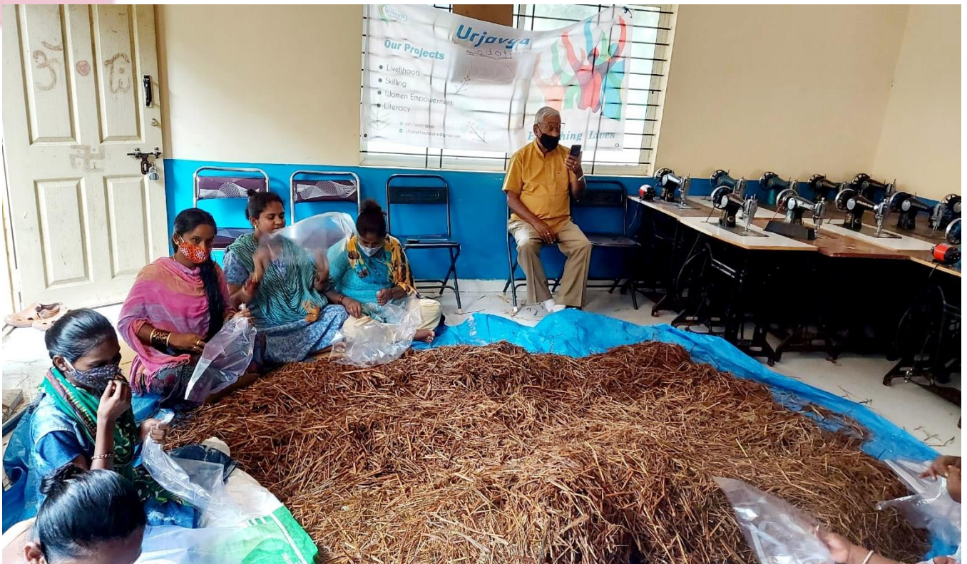
The session in progress at the Urjavya Foundation-established centre in Kudlu