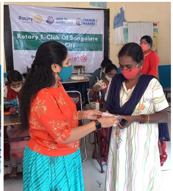
Participants receiving spectacles from Rotary E-Club of Bangalore Greencity members