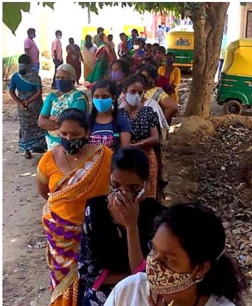
Beneficiaries queuing up near the distribution area