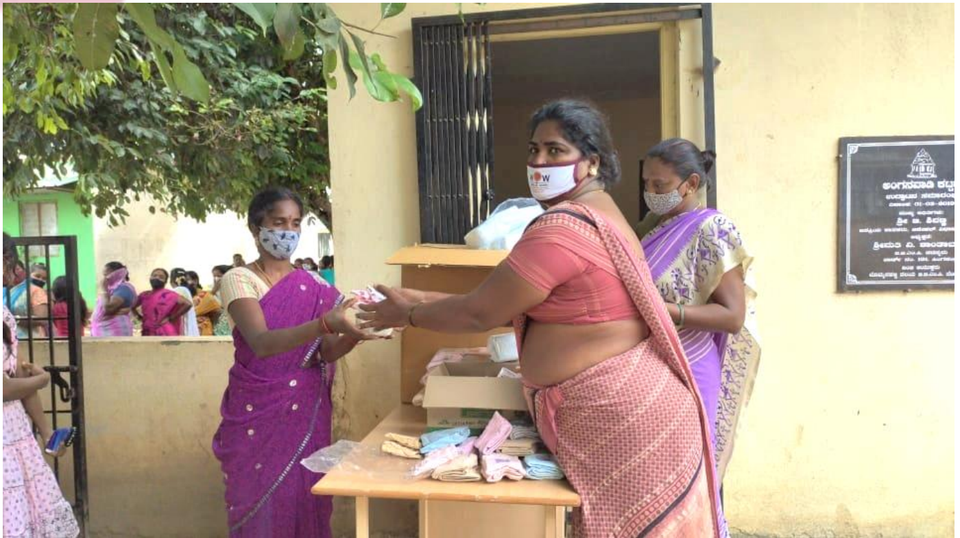
Sanitary napkin distribution with the queue of beneficiaries pictured in the background