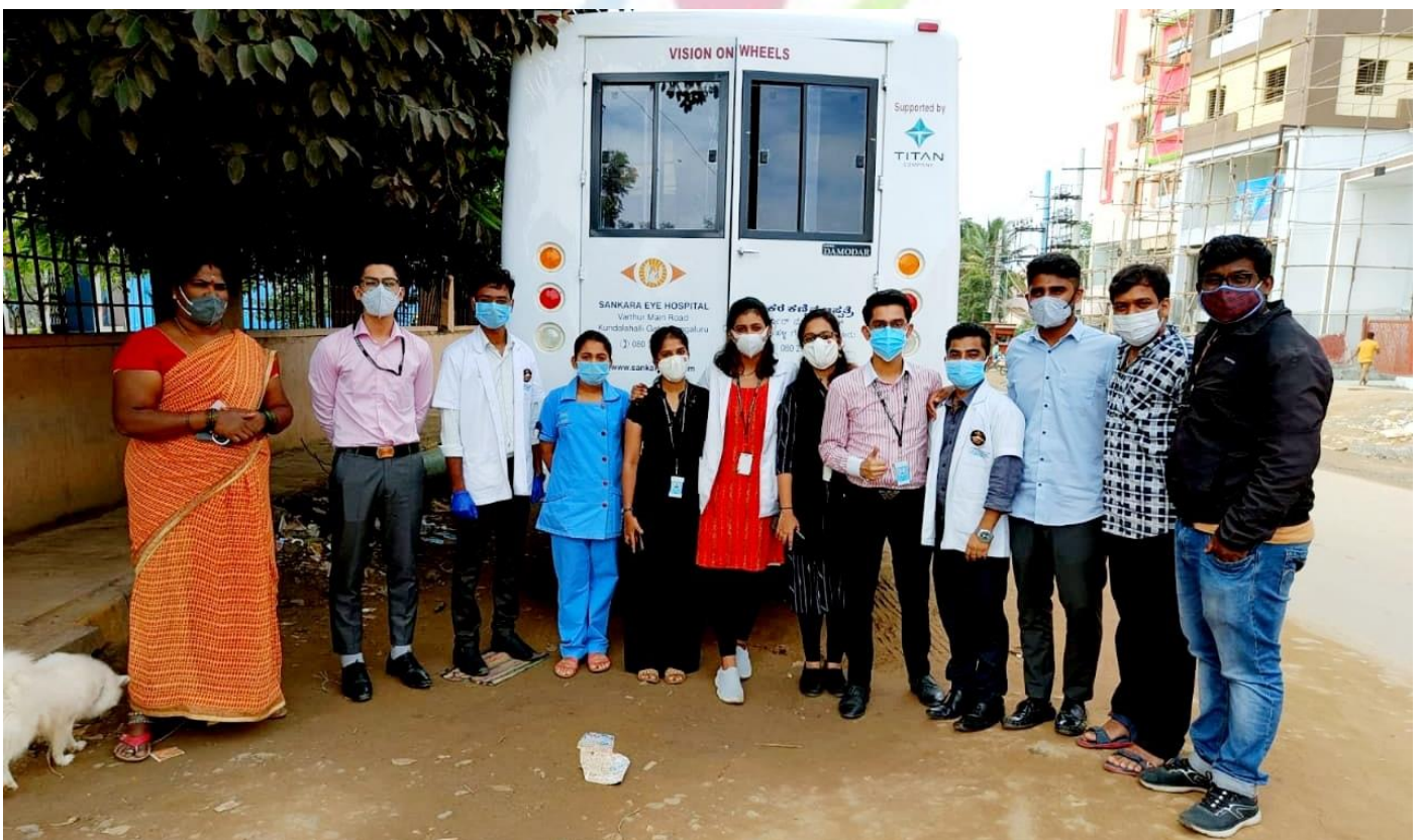
Sankara Eye Hospital team of specialists who conducted the check-ups