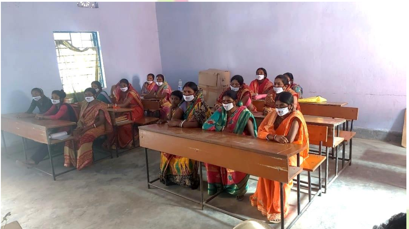
Anganwadi workers attending the session

In collaboration with NASSCOM Foundation, Urjavya Foundation has successfully trained Anganwadi workers on the mobile app MyAmbar in order to spread awareness regarding the occurrence of gender-based violence, and to allow people to recognise this and ensure their safety using technology. The trainers joined online, with workers attending in person.