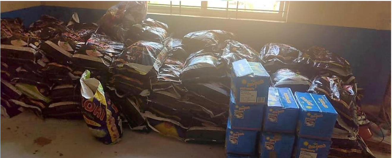
Grocery kits sponsored by UST Global and arranged by SD Foundation