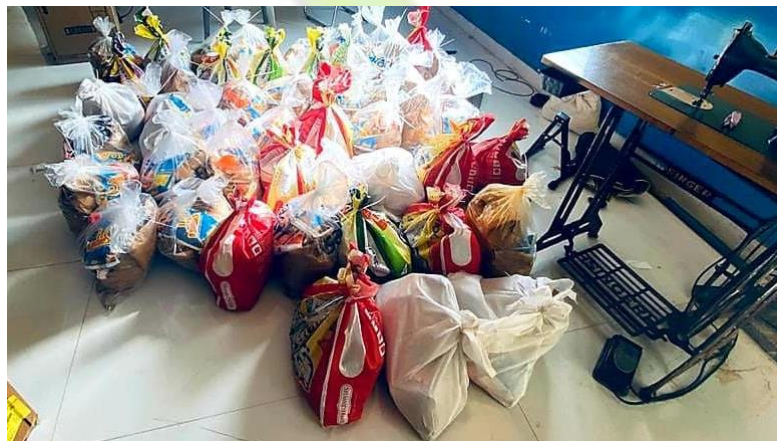
Grocery kits stored before the drive in the centre established by Urjavya Foundation