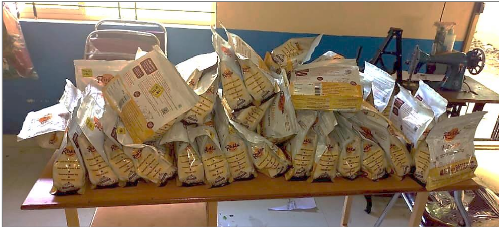
Dosa batter kits before commencement of the distribution process