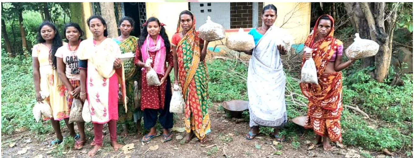
Beneficiaries with their mushroom bags