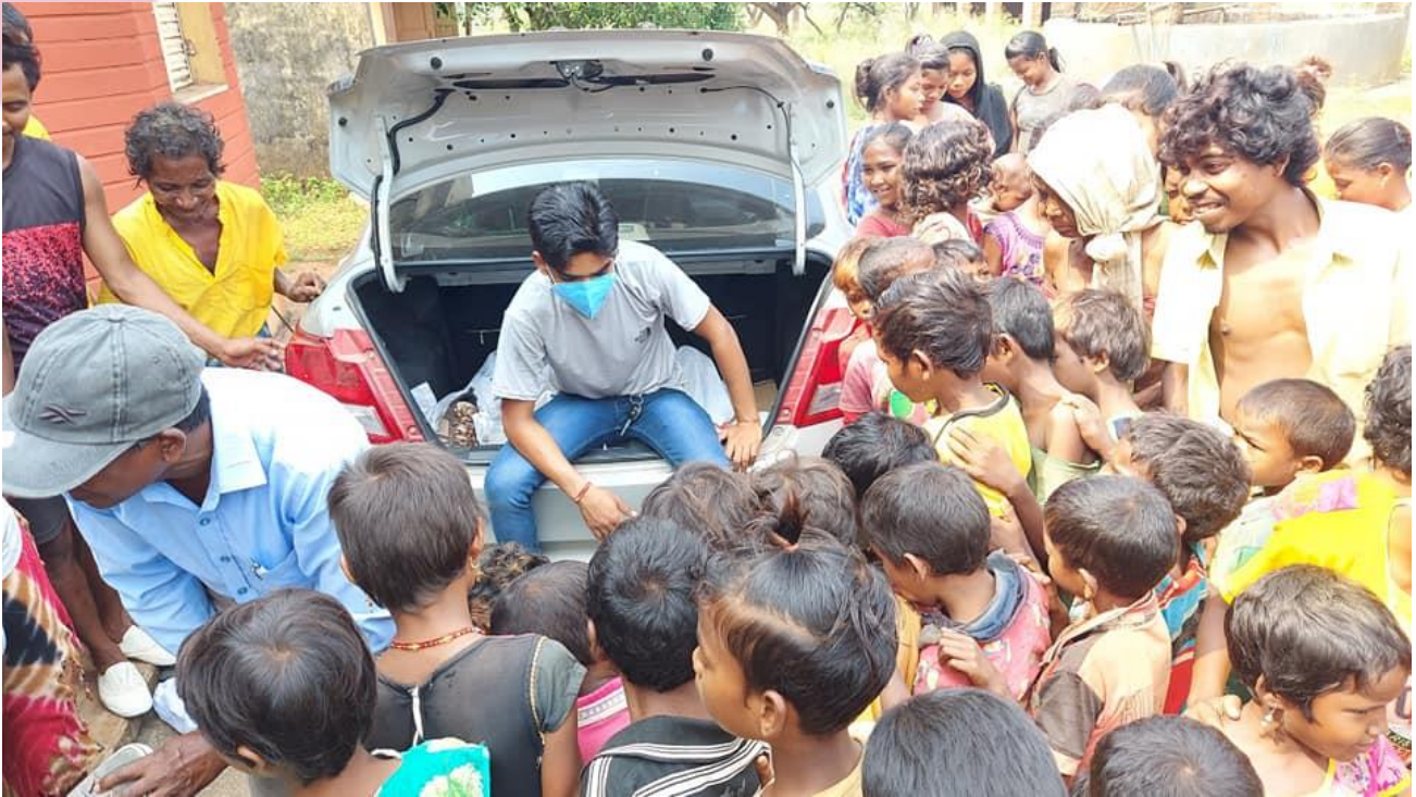
Beneficiaries receiving their footwear