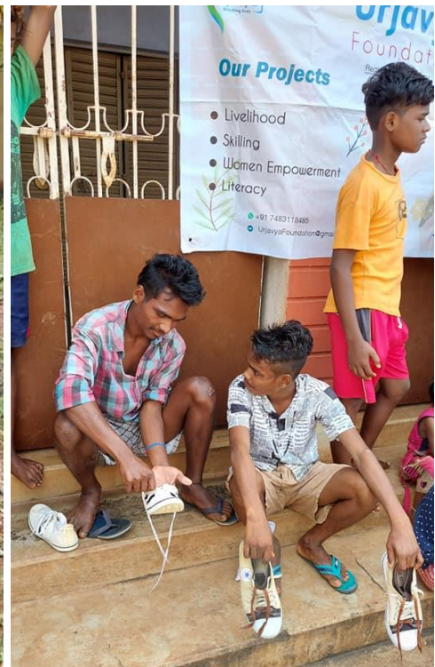
Some beneficiaries pictured with new footwear