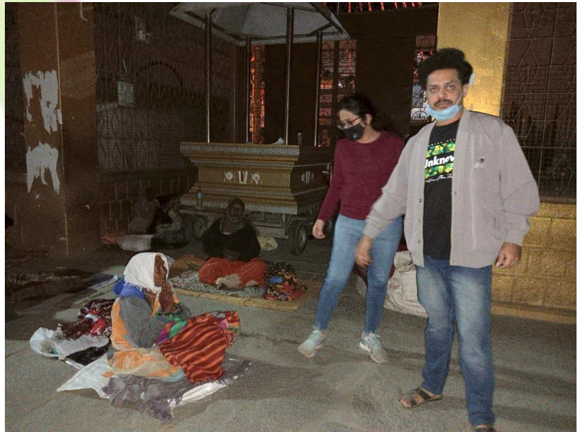
More beneficiaries pictured with their blankets