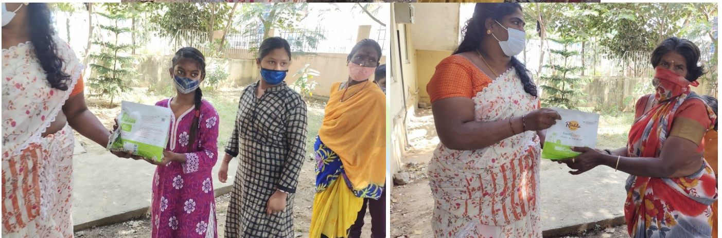
Beneficiaries receiving Rishta Dosa Batter Company's premium batter packages