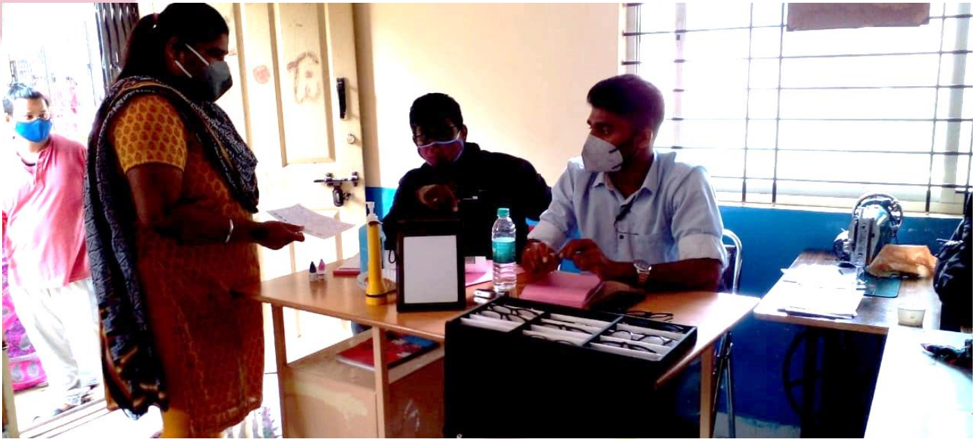
Document verification process of all participants