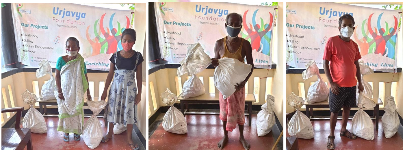
Some beneficiaries pictured with the grocery kits